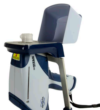
S1 TITAN Handheld XRF analyzer Mg (12) to U (92)