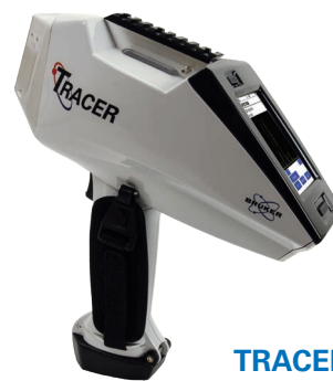
TRACER 5 Handheld XRF analyzer Na (11) to U (92)