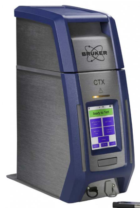
CTX™ Portable XRF analyzer Mg (12) to U (92)