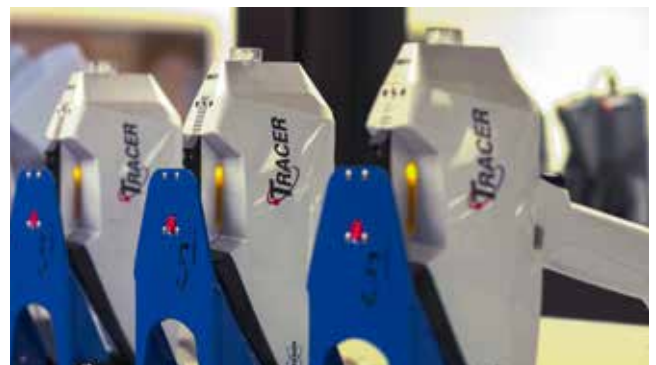
TRACER 5i battery operated handheld XRF spectrometers

Allied BioScience's presentation illustrated the high value of using Bruker's handheld XRF technology as part of their proprietary and patent pending rapid and cost-effective method to enable validation of their invisible antimicrobial polymer coating's activity at any time point.